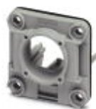
Panel mounting frame, IP67, for Freenet system, for round panel cutout, with grommet, without mounting screws, color: gray