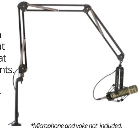
*Microphone and yoke not included.

The ProBoom ® 14192-B Extended Mic Arm, designed for studios where extra reach is required. It's 45" reach includes a 12" riser, but also fits our clamps, flat mounts and wall mounts. Also uses Elite ® arms with the wire management and beefy build. Available in Black and Gold.