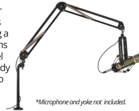
*Microphone and yoke not included.

Mounted on a 12" riser the 51900 series clears most consoles offering a 29" reach. Its Elite ® arms offer the same channel management and sturdy build of the 61900. Also available in Black and Gold.