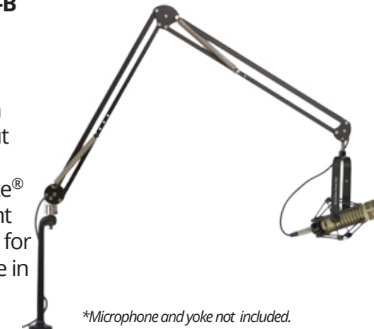
*Microphone and yoke not included.

The ProBoom ® 14199-B Extended Mic Arm, designed for studios where extra reach is required. It's 45" reach includes a 12" riser, but also fits our other mounts. Extra long Elite ® arms have extra mount points to adjust spring for heavier mics. Available in Black and Gold.