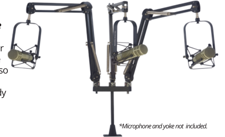
*Microphone and yoke not included.

A triple 12" riser holds three 29" reach arms for this classic Round Table setup. It's Elite ® arms also offer the same channel management and sturdy build of the 61900. Also available in Black and Gold.